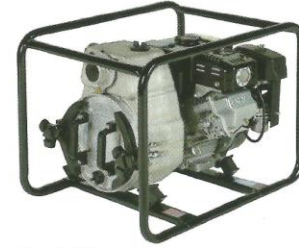
Robin Subaru EPT3-50RX